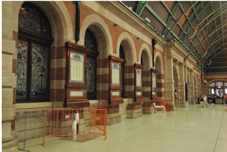
NSW Government Railways & Tramways Roll of Honour