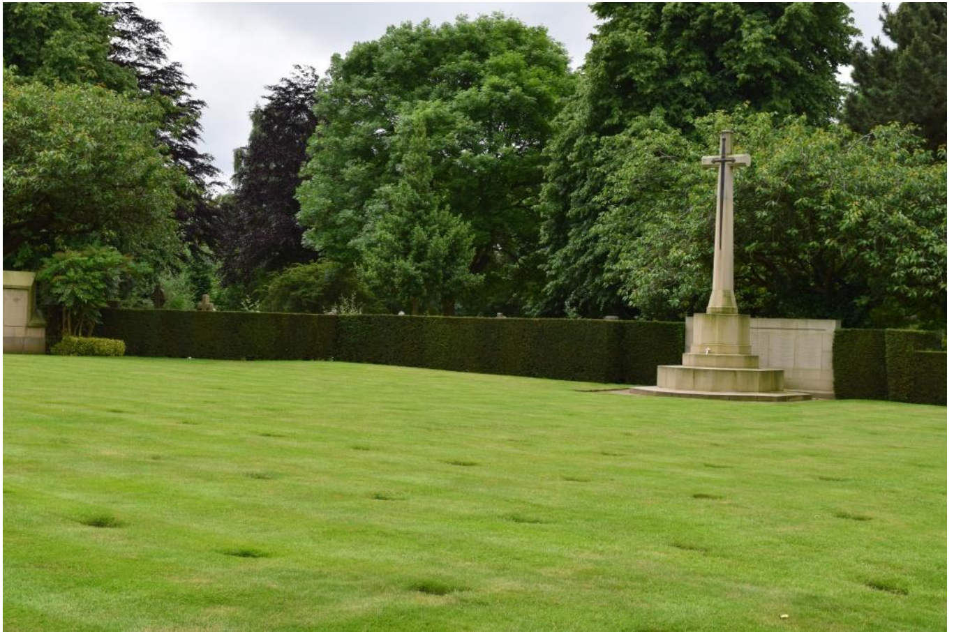
Lodge Hill Cemetery, Birmingham