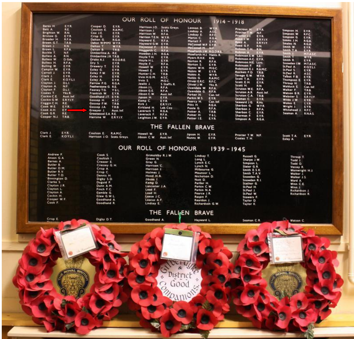
Gilberdyke WW1 & WW2 Roll of Honour