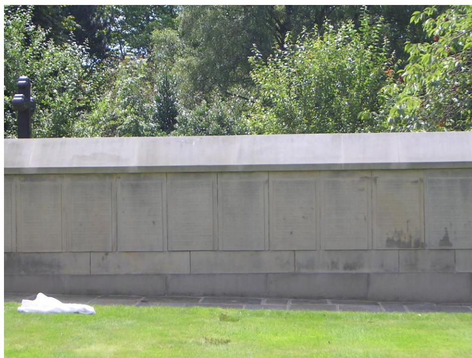
WW1 Screen Wall in Garden of Remembrance