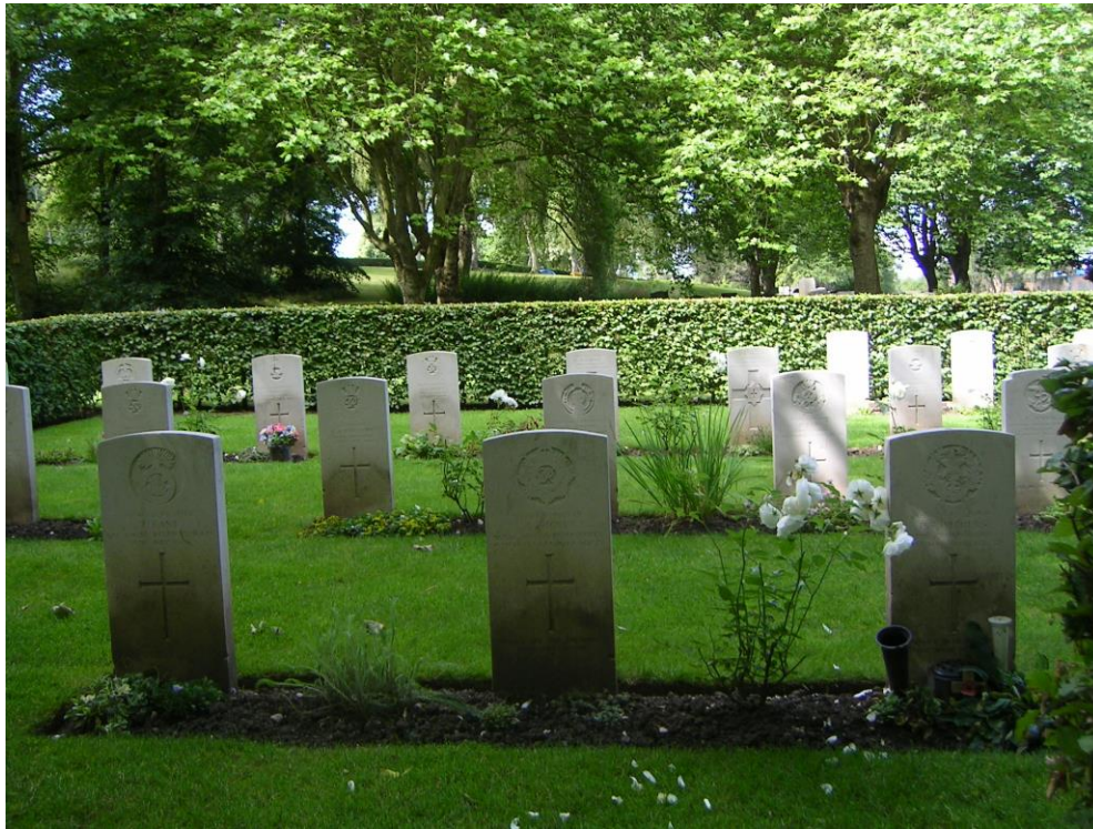
WW2 Garden of Remembrance